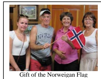
Gift of the Norwegian Flag